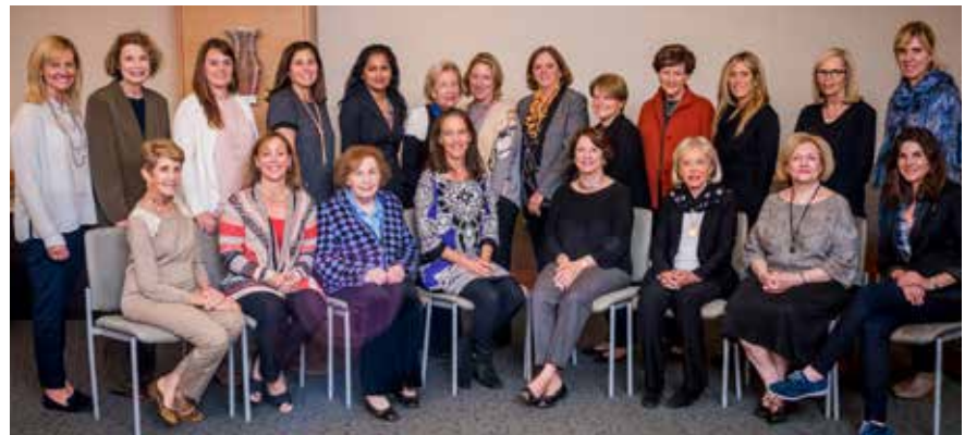
Members of the board of the Friends of Dana-Farber Cancer Institute, which made a leadership gift to the Edward J. Benz Jr., MD, Chair.